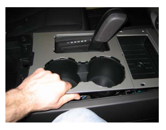
Replace the trim panel previously removed earlier